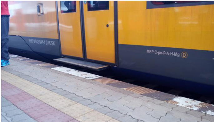
Platform versus vehicle