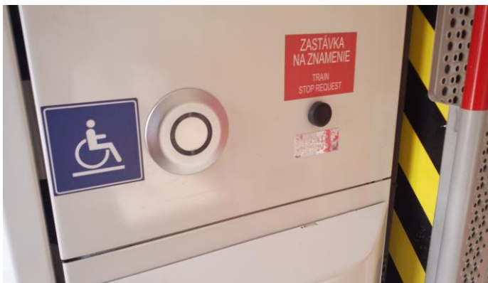
Communication with engine-driver