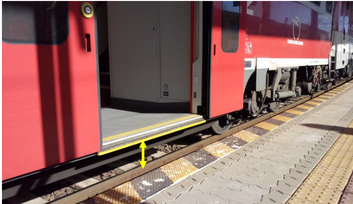
Vehicles versus platform