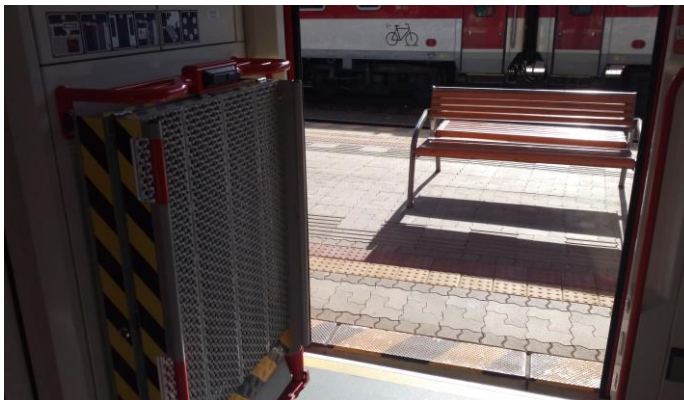
Railway platform versus vehicles