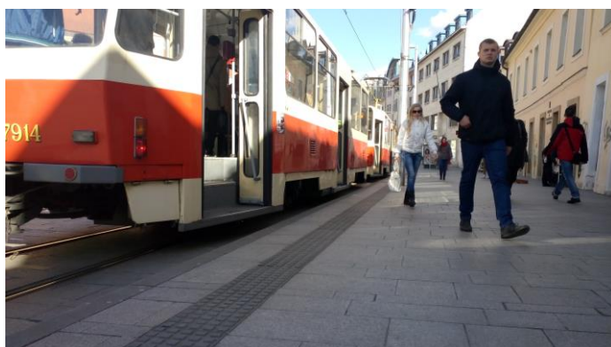
Tram stop – good for blind, poor for wheelchair